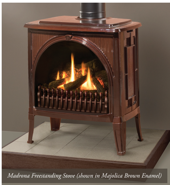
Madrona Freestanding Stove (shown in Majolica Brown Enamel)

Fireplace surfaces (in particular the glass window) are hot during operation and a period thereafter, resulting in a potential burning hazard. If small children are present, adult supervision is required. Also note, an optional safety screen and/or approved child barrier is strongly recommended. For further information please visit www.valorfireplaces.com/safety .